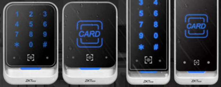
QR600 - HK