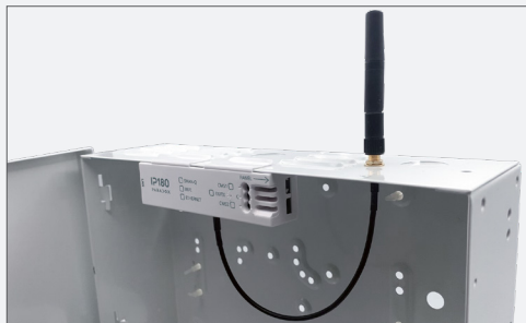
IP180 with Antenna Extension