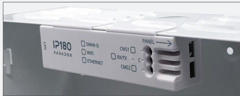
IP180 Installed in a Metal Box

The IP180 is designed with a space saving clip-on, perfect for rapid, no-screw installation and includes LED status indications. The Wi-Fi antenna can be easily connected and installed on the metal enclosure.