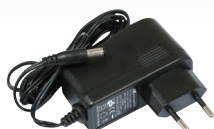
24 V 0.38 A power adapter