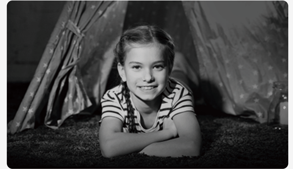
With Smart IR