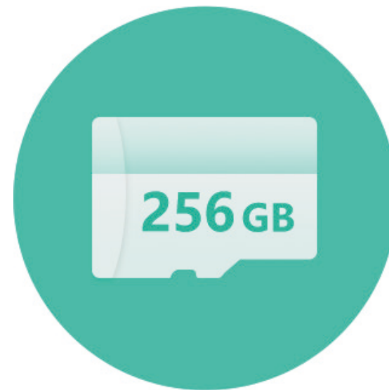
Supports MicroSD Card

*Cloud storage service is only available in certain markets. Please verify the availability before making any purchase.