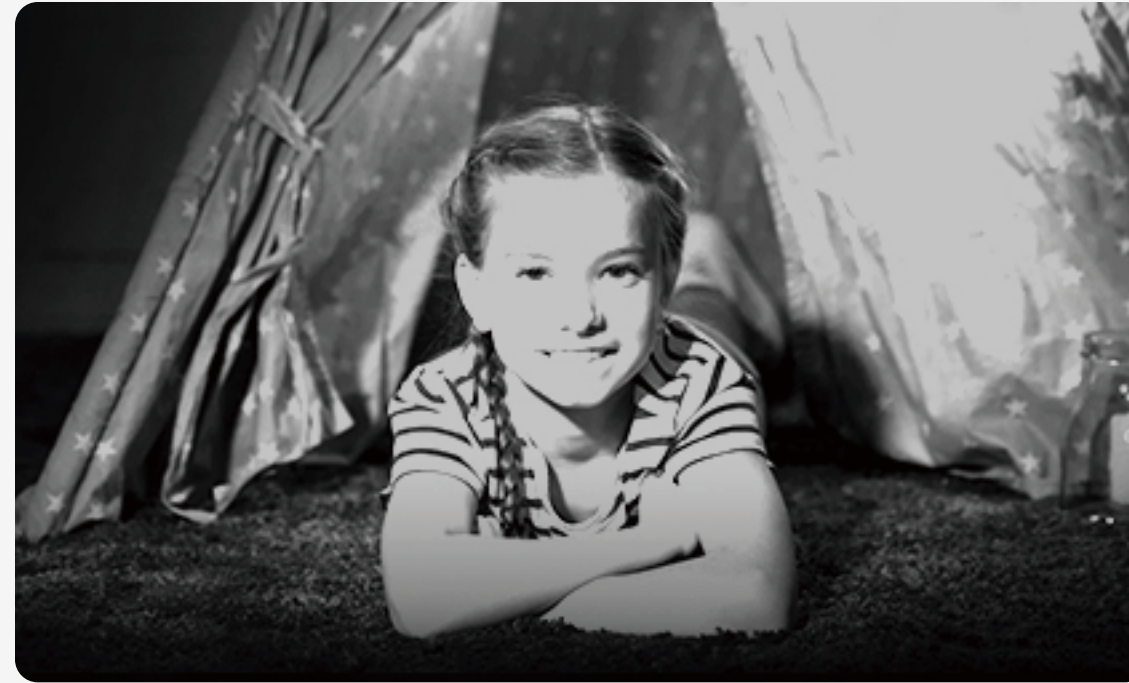
Without Smart IR

With Smart IR, the intensity of the infrared LEDs automatically adjusts to prevent overexposure in night vision mode, so you will get more details of the object or person captured at night.