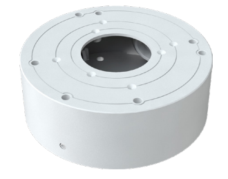
PR-JB12IP64 Small Junction Box