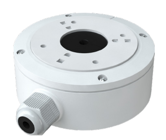
PR-JB12IP66 Small Water-proof Junction Box