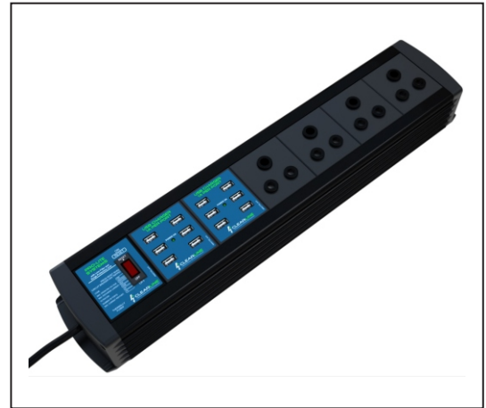
*Specifications subject to change without prior notice due to continuous improvements

This unit provides Protection for 4 AC Powered Devices. The unit will provide charging for up to 12 USB devices while also ensuring they are protected from surges. Line filtration has also been provided.