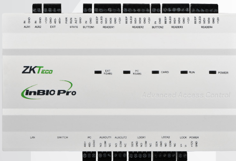
InBio-460 Pro Package B