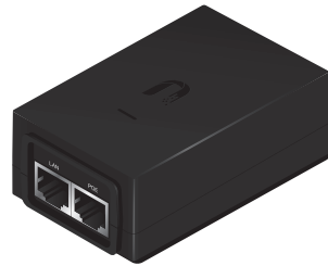
POE-24-24W POE-24-24W-G POE-24-30W