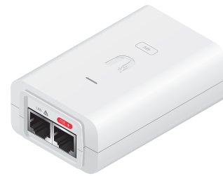
POE-24-24W-G-WH POE-48-24W-WH POE-48-24W-G-WH