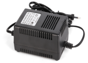
AC24V/3A Power Adapter